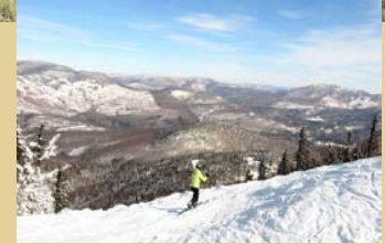
Forever views of Merrill Hill