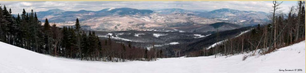
Garry Sawami © 2006